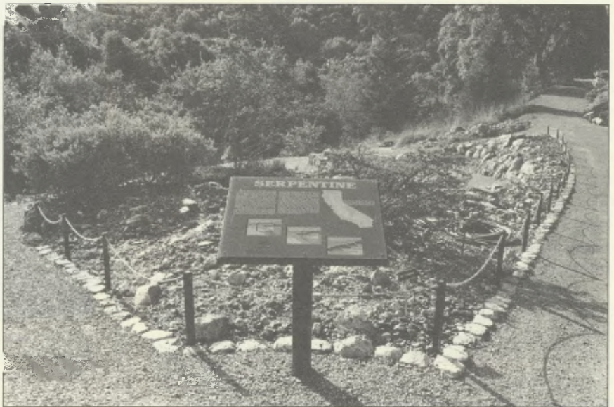
The new Serpentine Section of the Botanical Garden, officially unveiled to the public on April 25, 1993, is one of the world's largest and most inclusive garden displays of serpentine plants on natural soil and rock.

The word "serpentine" has been used to describe rock, soil, vegetation and flora; yet for the geologist, serpentine is a mineral class, the constituents of serpentinite rock. They are composed mainly of iron magnesium silicate, with "impurities" of chromium, nickel and other toxic metallic elements. Because of this unusual chemical makeup, the soils weathering from serpentinite and other ultramafic rocks (peridotite, dunite) are infertile (high magnesium to calcium ratio) or even toxic to most plants. But nature meets such a challenge with evolutionary opportunism. Plants have become adapted to serpentines everywhere these rocks reach the surface on our planet. The nature of the adaptation to serpentine ranges from strict serpentine endemics, narrowly confined to serpentine (like Quercus durata , Streptanthus polygaloides